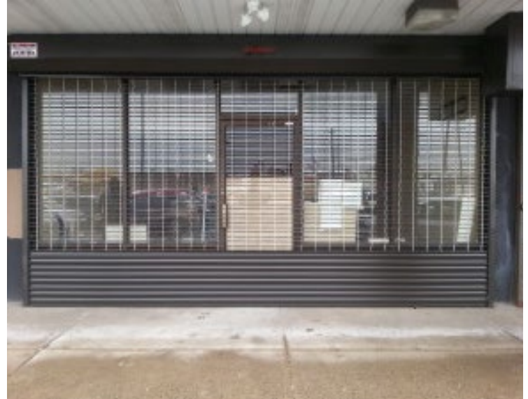
Shown with optional grille/slat combination

E-Series Grille™ is designed for easy operation and long life use with minimum maintenance required. Ideal for stores, malls and shopping centers. This roll down security door is also used to protect glass window and service window openings.