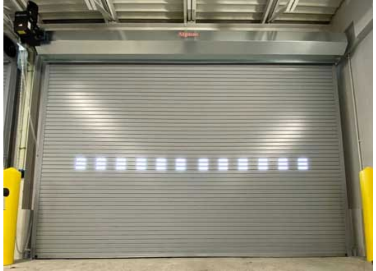
Shown with optional Vision Lites

The IMB-V7 insulated roll up door is used for warehouses, loading docks, parking garages, aircraft hangars, fire houses, truck terminals, police stations, correctional facilities, manufacturing and retail applications among others.